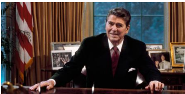
Ronald Reagan in the Oval Office, 1986.

The Reagan Revolution of the 1980s sought to change Americans' attitudes toward their country, their government, and the world, as the United States emerged from the 1970s. Ronald Reagan entered the White House in January 1981 promising to restore Americans' faith in their nation and themselves, to shrink "Big Government," and to defend America more aggressively, especially against the Soviet Union. During his two terms in office, President Reagan continued his decades-long battle against Great Society liberalism, the activities and ideas of the 1960s' student rebels and 1970s' defeatists, and the spread of Communism. Reagan's American restoration delivered patriotism, prosperity, and peace. American pride revived as the economy soared and the Soviet domination of Eastern Europe collapsed. "All in all," Reagan said in his 1989 farewell address, "not bad, not bad at all."